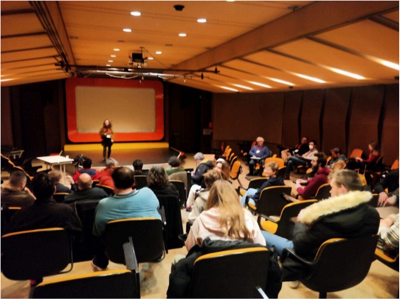
The picture is blurry, but you can see the main thing: the « Star Trek » room we used during the plenary sessions.