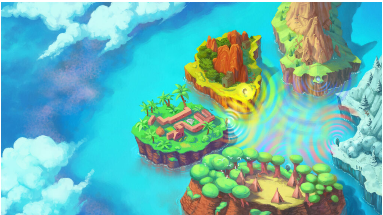
ECHO Network

On the other hand, trying to step out of our comfortable FOSS-enthusiasts' bubble to try and reach out to other communities that are changing the world, has proved to be not as desorienting as we might have thought. We found that oftentime we shared the same utopias and the same definition of society: one based on contributing.