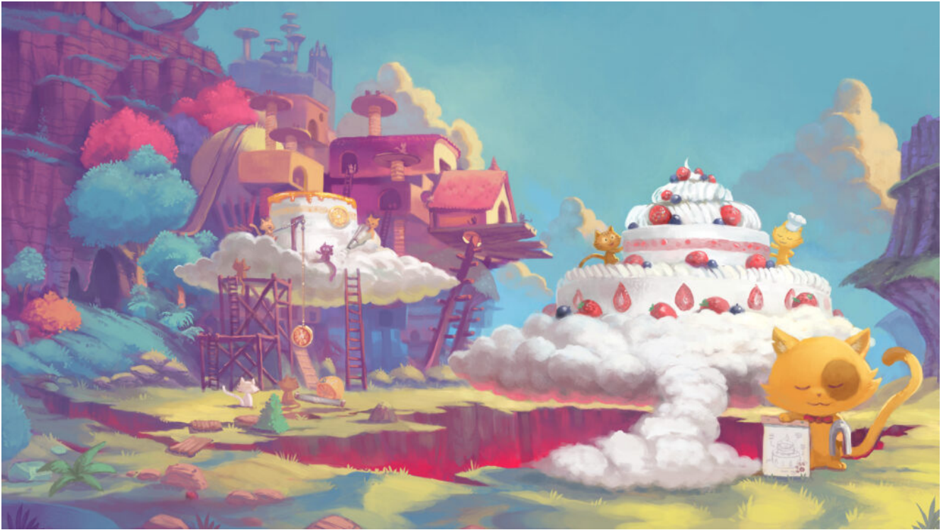
Emancip'Asso

We have been hearing this need for this kind of human, tangible support for a while, and this is not unexpected. One of the mechanisms of capitalism is to individualize (« the customer is always right ») so as to better isolate and place the responsibility on each of us. For example, the information that we name « personal data » is neither personal nor data: it is more accurately the digital harvesting of our lives linked to those of others. Those are our social behaviours .