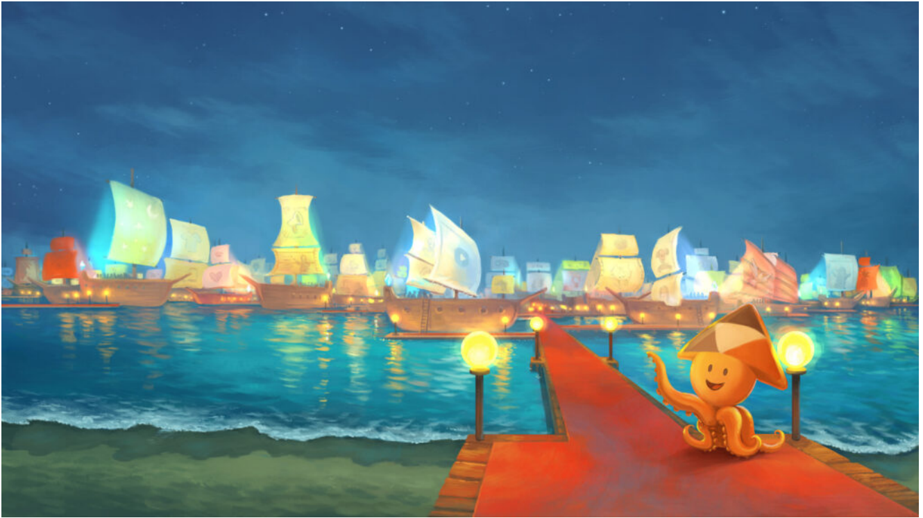
Peer.Tube - Illustration by David Revoy - License: CC-By 4.0

Similarly, the 39 members that compose Framasoft (10 of whom are employees) cannot spawn everywhere to personally train each and every new organization that wants to use, let's say Framaspace, especially as that number could rise - with the help of your generous donations - up to thousands of organizations within 3 years!