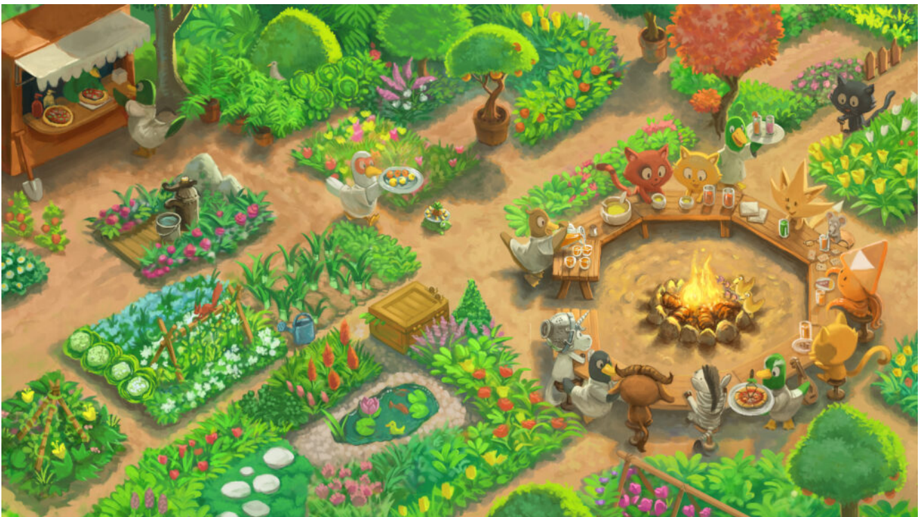
Collectivise, convivialise - Illustration by David Revoy - License: CC-BY 4.0

This article was published in French in October 2022 as part of the launch of Framasoft's new roadmap Collectivise the Internet / Convivialise the Internet.