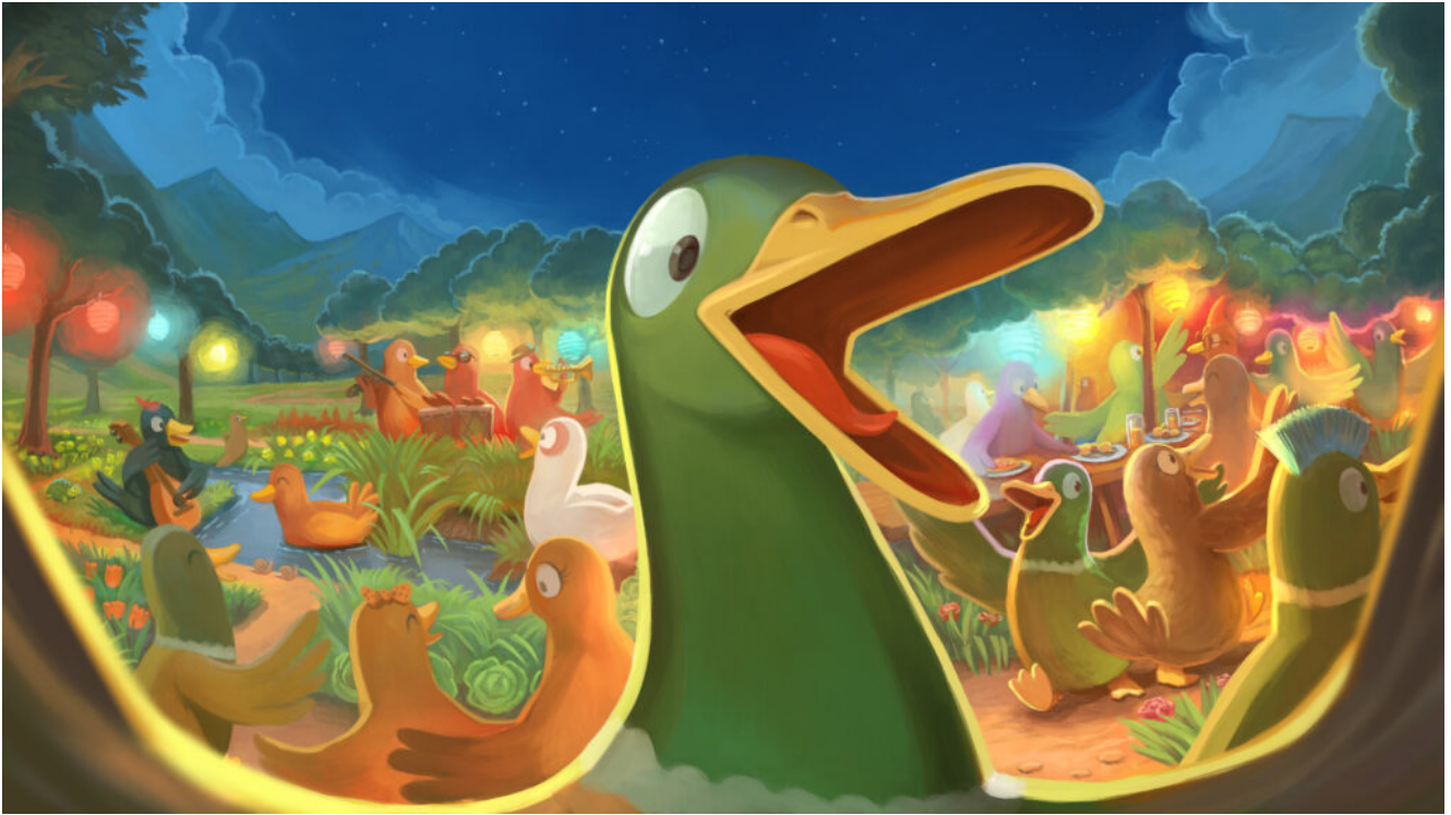
Quack-quack - Illustration by David Revoy - License: CC-By 4.0

If you agree with our set goals and strategy, if the actions that we are currently undertaking seem important to you, then we would like to remind you that Framasoft is exclusively funded by... You. It is only your kind contributions, eligible to a 66% tax cut for French taxpayers, that allow us to keep going in total independence.